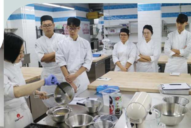
▲ 教學廚房實驗室 Culinary Lab