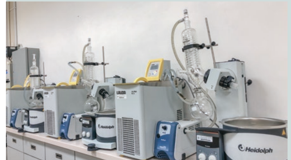
▲ 綜合化學實驗室 General Laboratory for Chemistry