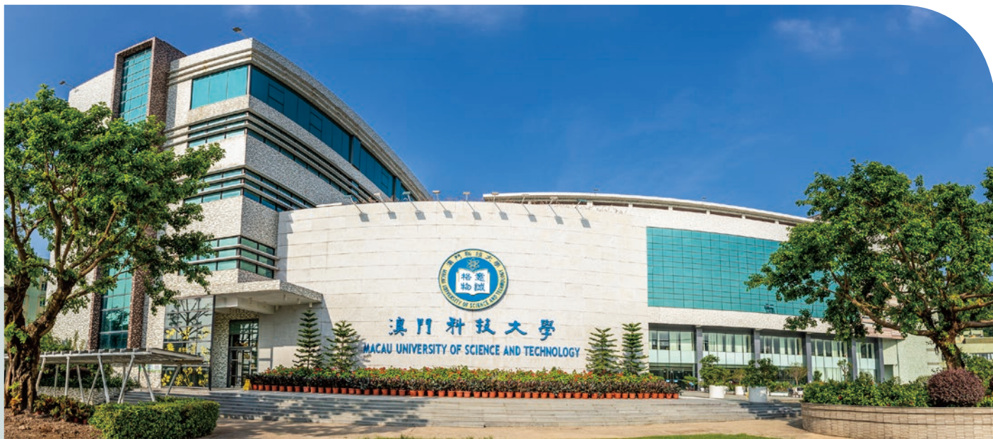
▲ 圖書館大樓 Library Building