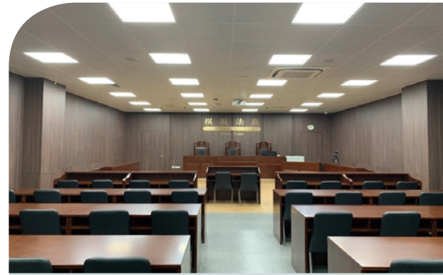
▲ 模擬法庭 Moot Court

After years of development, M.U.S.T. now owns two state key laboratories, the State Key Laboratory of Quality Research in Chinese Medicines and the State Key Laboratory of Lunar and Planetary Sciences; and a number of prominent institutes and research centers such as Macau Institute for Applied Research in Medicine and Health, The Institution for Sustainable Development, Space Science Institute, Institute for Social and Cultural Research, Macao Institute of System Engineering, Macao Centre for International Standard of Chinese Medicines, Research Center for Arbitration and Dispute Resolution, Macao Media Research Center, Macao Environmental Research Institute, Macao Institute of Fintech Innovation,