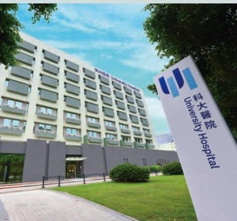
▲ 科大醫院 University Hospital

在教學設施方面，大學不僅校園優美，更有多座現代化教學大樓和一批設施完善的教學實驗室，以及館藏豐富的大學圖書館等。大學倡導兼容並蓄、和諧精業、尊師愛生，培育學生綜合素質和促進學生全人發展。大學設立導師制度輔助學生在學習和生活上解決疑難。大學鼓勵學生積極開展各種課餘活動，包括組織多種形式的學生社團活動，培養學生的組織能力和社會認知能力，同時拓寬知識領域。大學為學生提供開展豐富多彩課餘活動的各種設施，設立學生活動中心及鋼琴室、排演廳和多功能廳等，常年供學生免費使用。藝術團為學生提供施展藝術才華的舞臺，已成為大學的文化藝術品牌。創業就業發展中心協助學