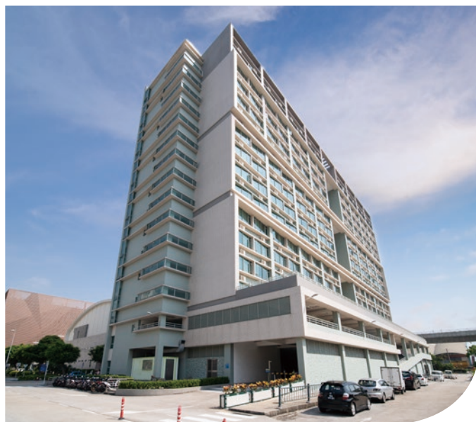
▲ 學生宿舍 Student Dormitory

展望未來，澳門科技大學將繼續以教研為本，廣納賢才，牢牢把握“質量”和“創新”兩個關鍵要素，充分發揮非牟利私立大學之優勢，不斷發展優質教育和卓越研究，服務社會，實現其辦學宗旨和教育使命。