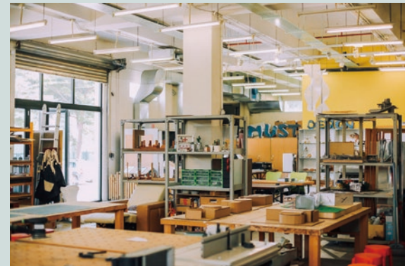
▲ 金木工實驗室 Metal & Wood Art Design Lab